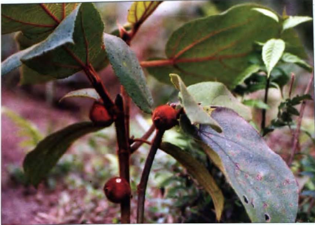
Ficus hirta var. roxburghii (Miq.) King