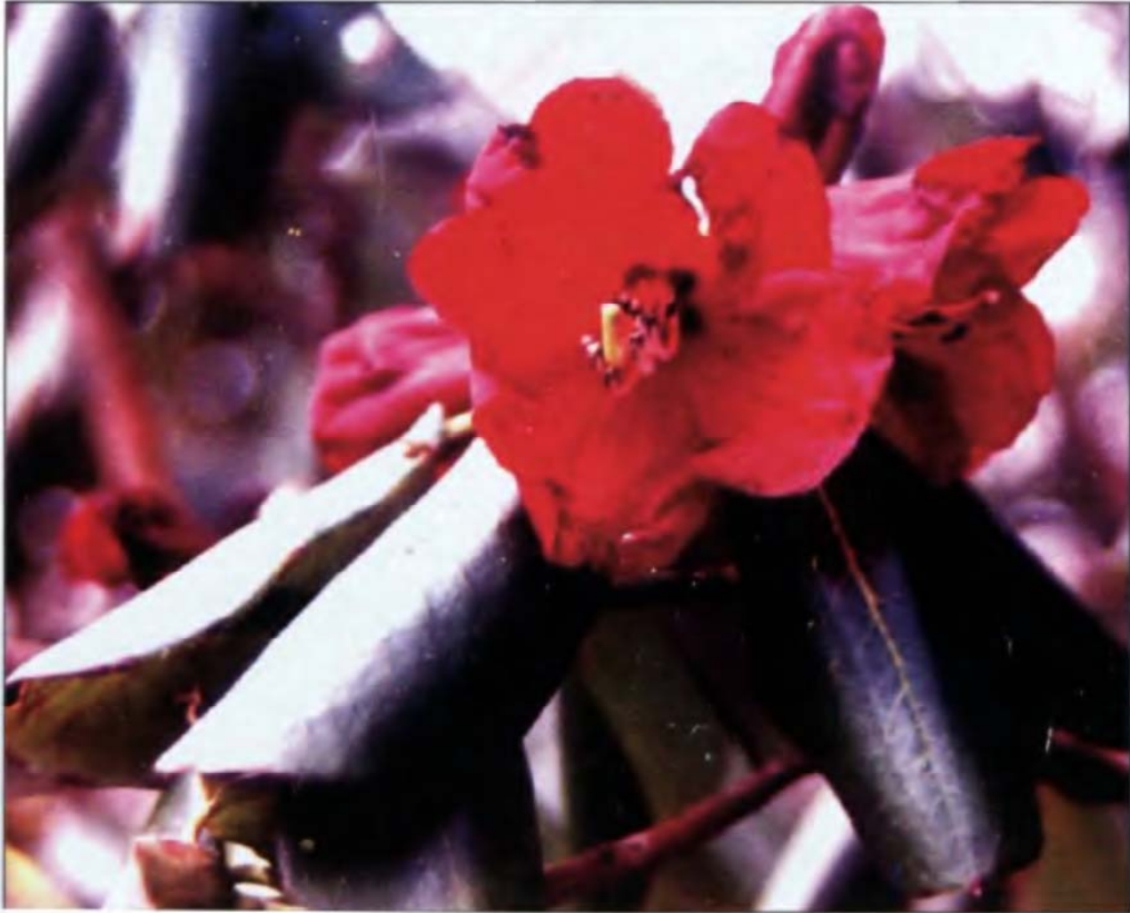
Rhododendron thomsonii Hook. f.