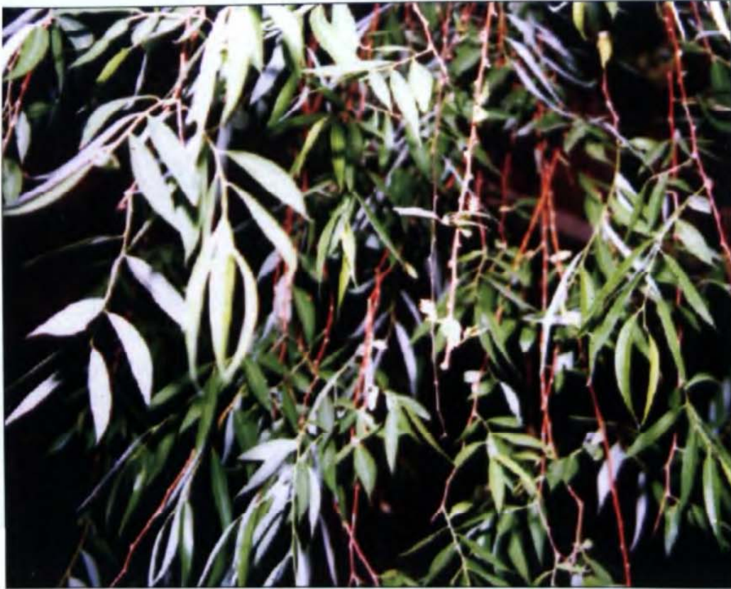
Salix babylonica L.