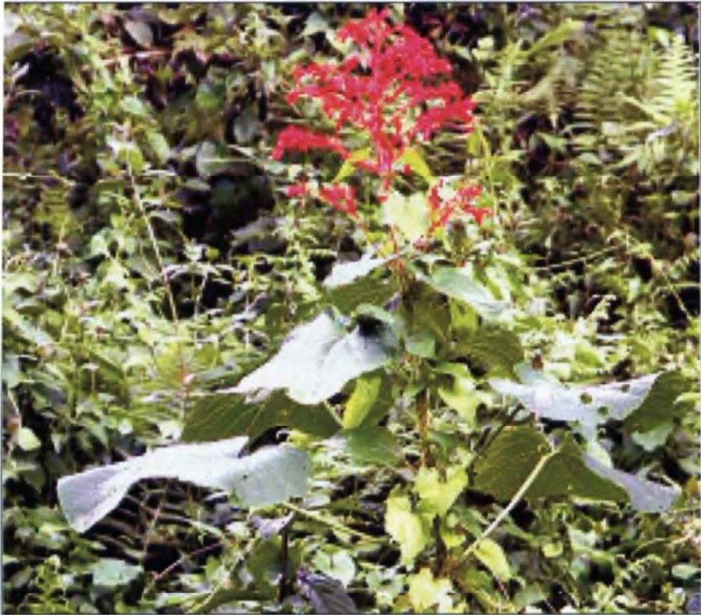
Clerodendrum japonicum (Thunb.) Sweet