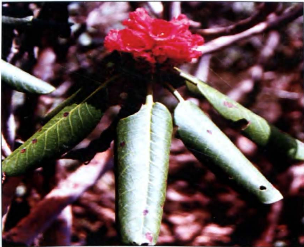
Rhododendron hodgsonii Hook. f.