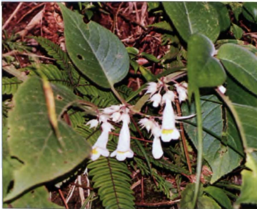
Rhynchosyris obliquum Blume