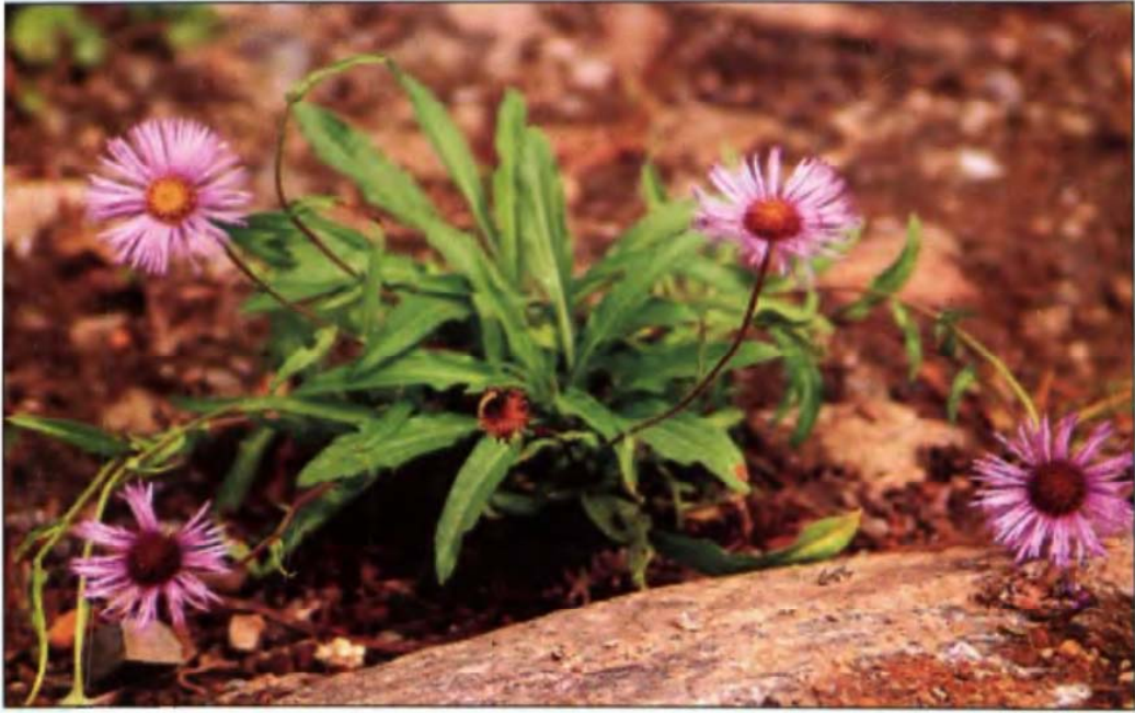
Aster tricephalus C.B. Clarke