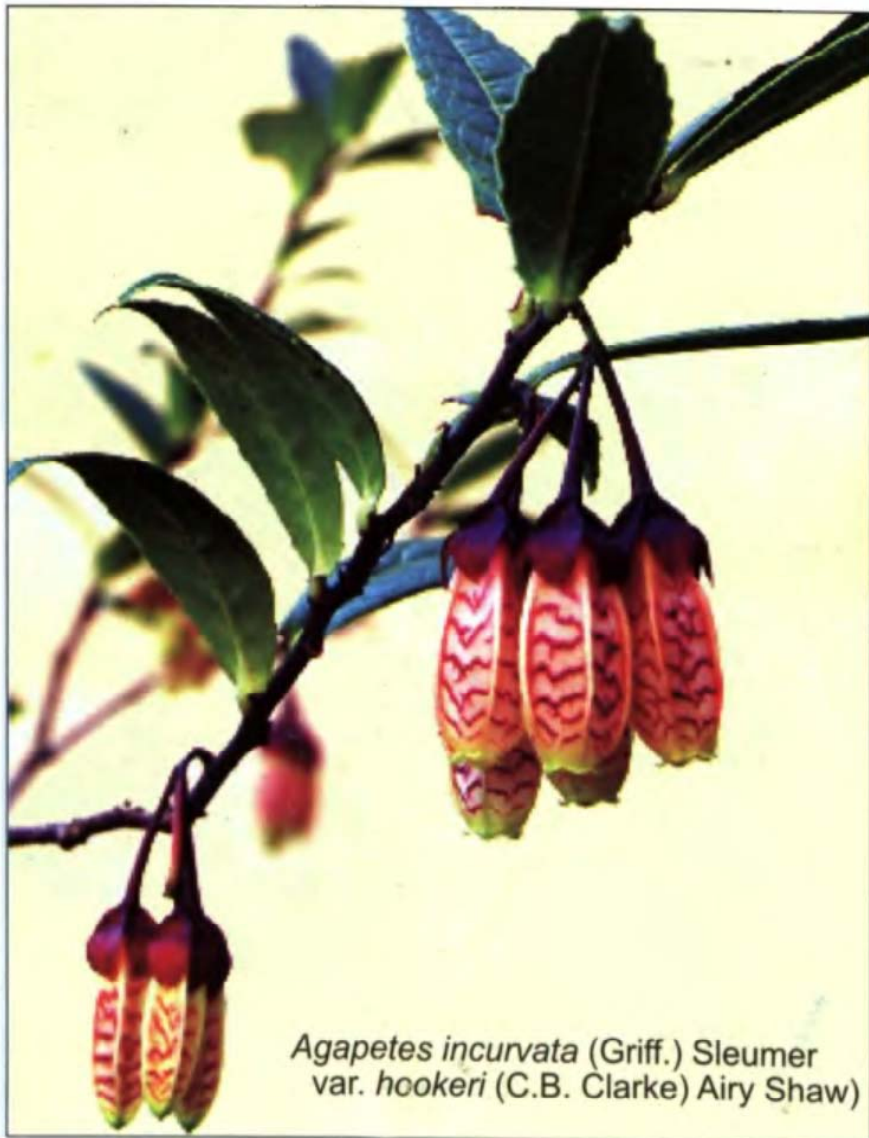
Agapetes incurvata (Griff.) Sleumer var. hookeri (C.B. Clarke) Airy Shaw