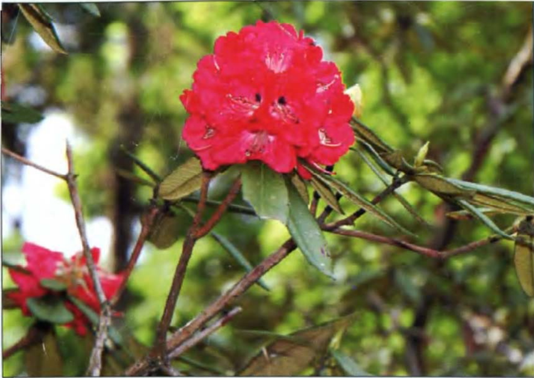
Rhododendron arboreum subsp. delavayi (Franch.) D.F. Chamb.