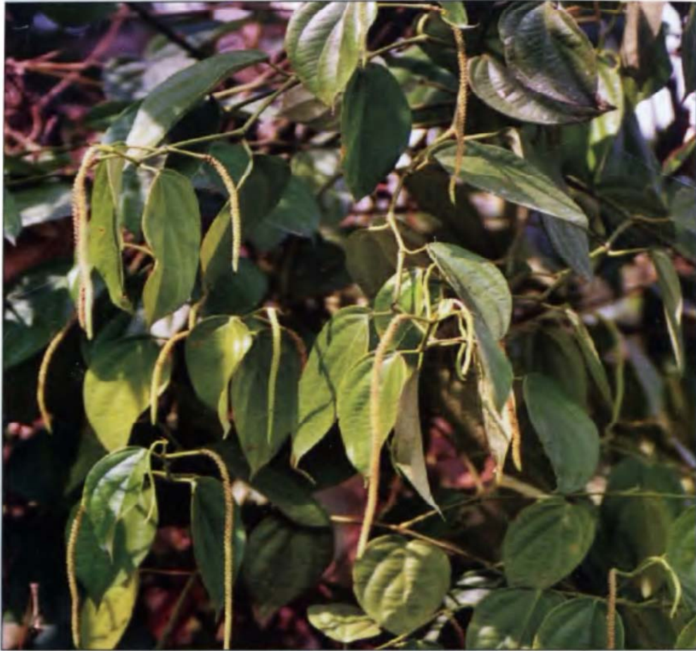
Piper nigrum var. macrostachyum C. DC.