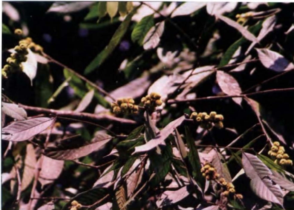
Castanopsis indica (Roxb.) Miq.