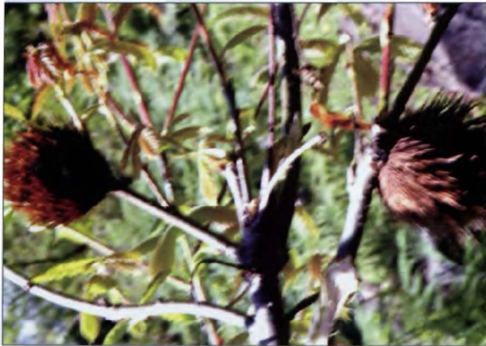
Quercus griffithi Hook. f. et Thomson ex Miq.