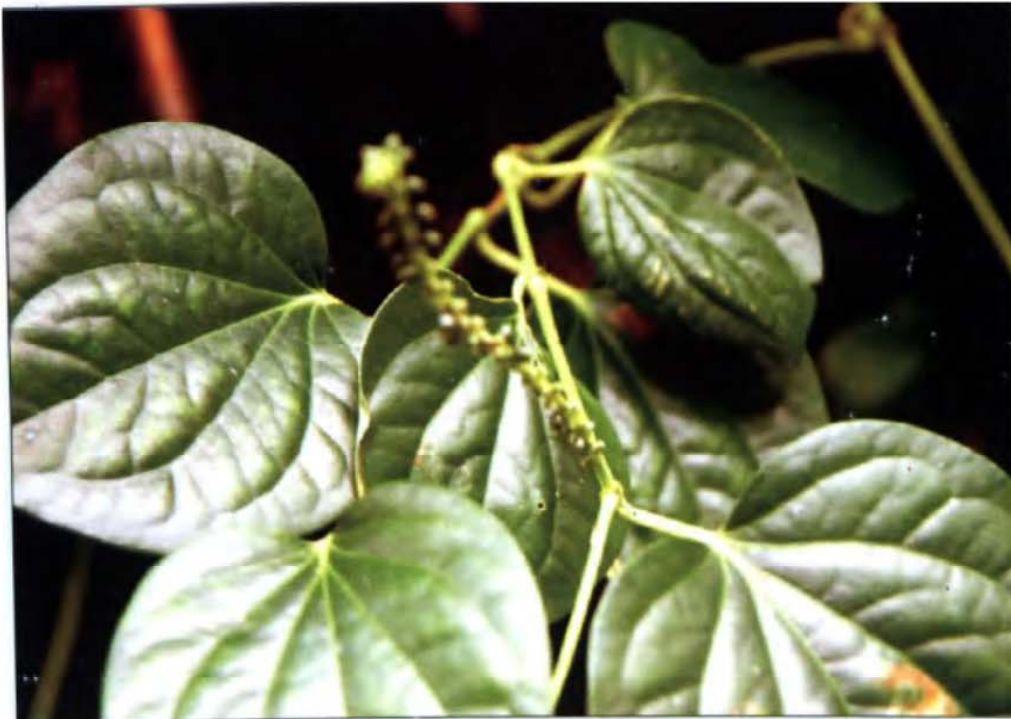
Piper sylvaticum Roxb.